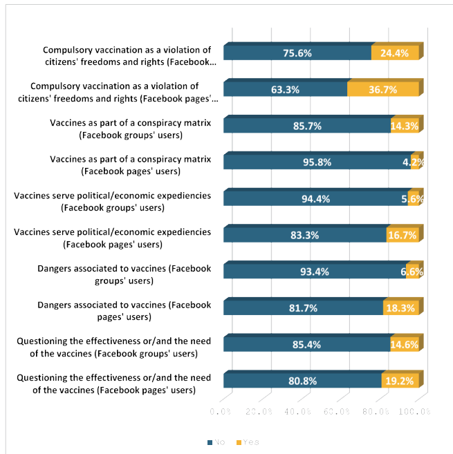
Figure 2 Major anti-vaccination themes raised on Facebook posts in Greece per type of account (September-November 2021, in %)